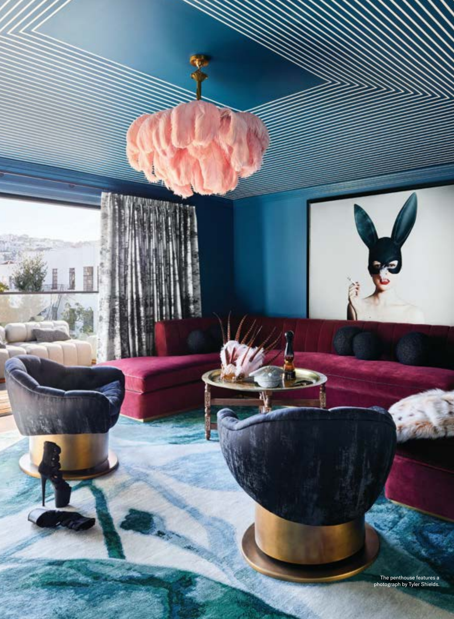
The penthouse features a photograph by Tyler Shields.