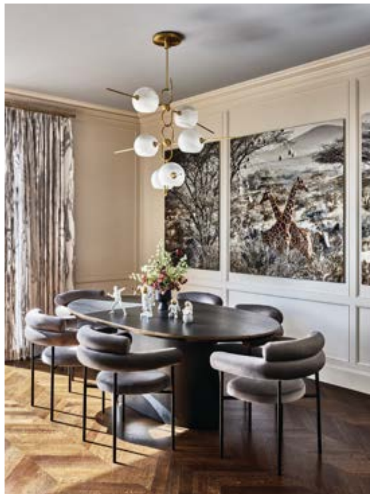
An informal dining space, which is perfect for informal gatherings of family and friends, features Nuevo chairs upholstered in Casamance velvet and a David Weeks chandelier. Opposite page: The primary suite offers a calming vibe with a custom headboard covered in silk mohair velvet from Rogers and Goffigon, a wing chair from Arteriors and hand-blown pendants from SkLO Studio. A hand-knotted rug from Kush Rugs lines the room.

“The design is layered with many colors, patterns, textures and luxury finishes, including leather, feathers and fur. Many rooms juxtapose soft, feminine touches alongside bold pieces.”