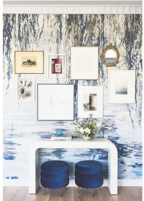
Above: This photograph showcases the foyer and gallery wall within the Crescent's penthouse in Nob Hill. Below: The spacious spa bathroom at Crescent's penthouse is clad in Bianco Dolomite Marble.

Each of the three graciously sized bedrooms overlook iconic views of San Francisco and the bay. The owner's suite serves as a tranquil oasis, with Cloud Sky wallpaper by Emma Hayes, a reclaimed Douglas Fir dresser and antique table lamps. The suite's focal point is the dazzling view and immediate access to an expansive private terrace that spans the room's entire southern wall. A pair of bathrooms in the penthouse are clad almost entirely in Bianco Dolomite marble.