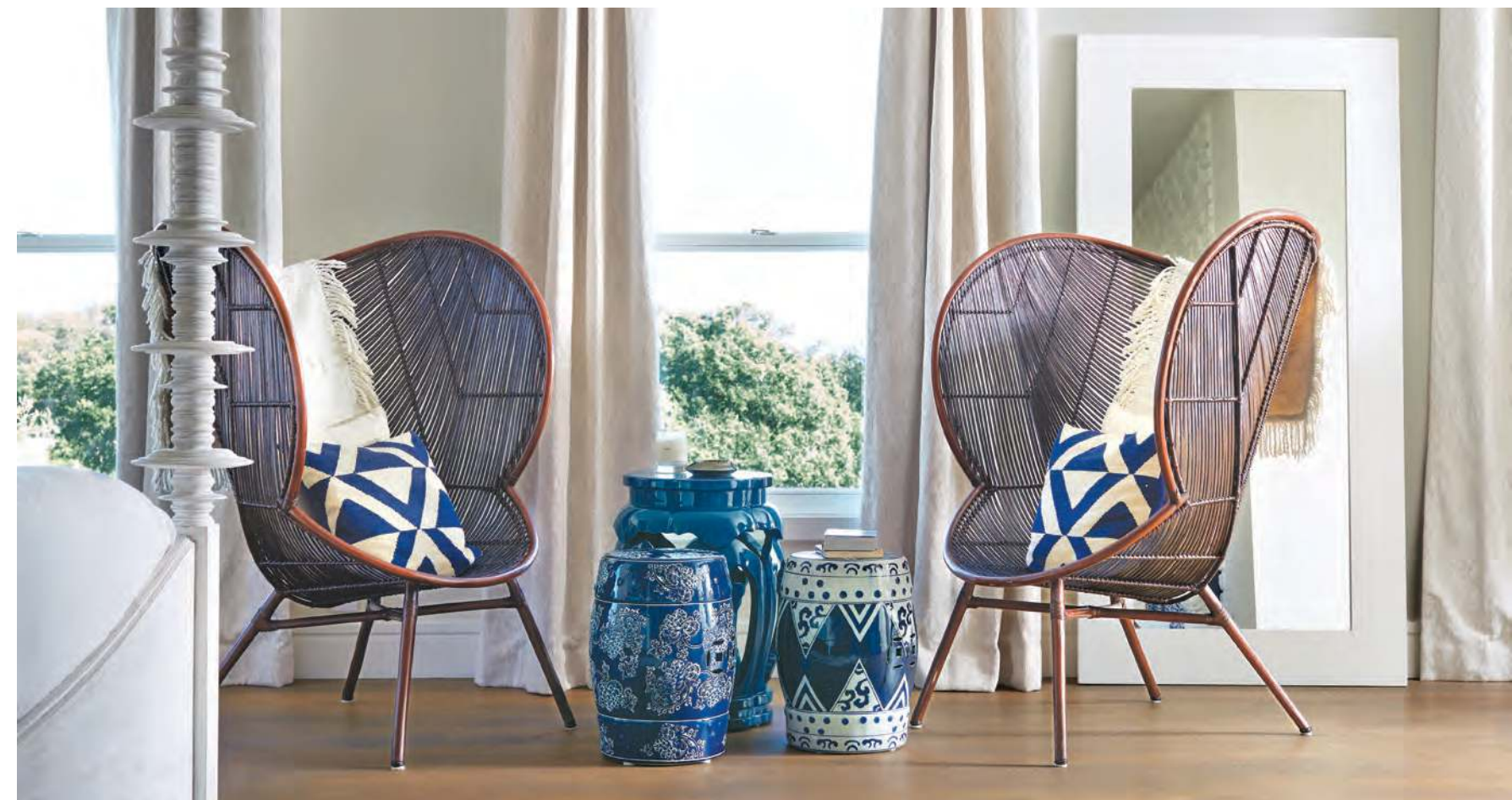
Outside In (ABOVE) An inviting vignette beckons alongside the master bedroom window wall: Stylish rattan Olaf chairs from Roost flank a grouping of blue and white ceramic garden stools. Pattern Play (BELOW AND OPPOSITE PAGE) Master bathroom walls are wrapped in Elitis' Azzurro wallcovering through Donghia. Window panels are Pindler & Pindler's Darnell linen in ivory. A Kohler tub filler complements a freestanding tub. Personal elements add meditative touches. Mirrors are from One Kings Lane. See Resources .