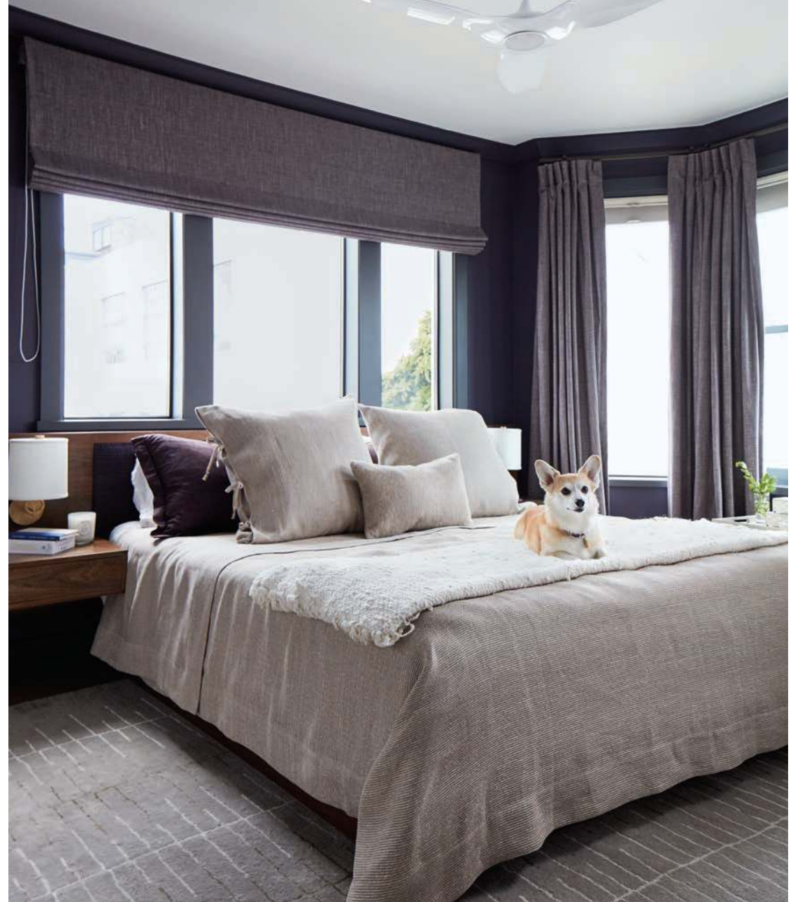
Brilliant Solutions In the master bedroom (THIS PAGE), sconces from Visual Comfort's Barbara Barry collection flank a Seventh & 7th Designs custom bed and headboard, which wears a Zimmer + Rohde fabric. Bedding is through Anthem. Decorative boxes, tray and crystal dish are through Plantation. A pair of Luis Weisdorf Multi-Lite pendants illuminates the breakfast nook (OPPOSITE PAGE); barstools from Four Hands wear a Robert Allen fabric. Marble bowls from Plantation. See

"It's cool. It's quirky. Now they come home to something that gives them energy"